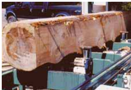
A large pine log being squared up before cutting boards.