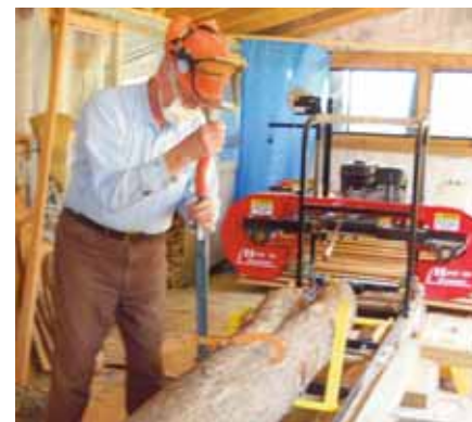
Fig. 3. With the mill elevated and both dogs raised, it is easy to turn logs on the track to find the best opening face.