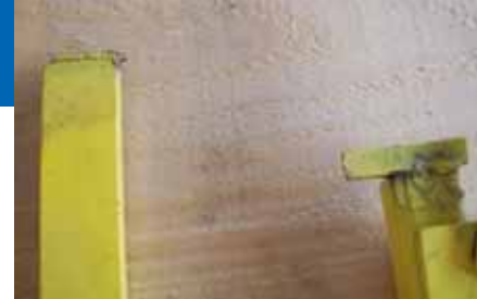
Fig. 4. Modified dogs. The fixed dog (left) has a projecting 1/8-in. point at top while the moveable dog (right) has had the offset point moved to the top of the vertical post.

blade life. I keep mine clean by forwarding them to the mill deck with a Logrite ATV arch and drop them onto wooden stringers. Any extraneous dirt is removed with a long-handled barbecue cleaning brush. Eventually I hope to get water to my mill, and electricity so I can clean logs and clean the track with a shop vac. It is essential to keep the track clean, especially when sawing resinous woods. Resinous sawdust can build up on track rails and in the carriage wheel