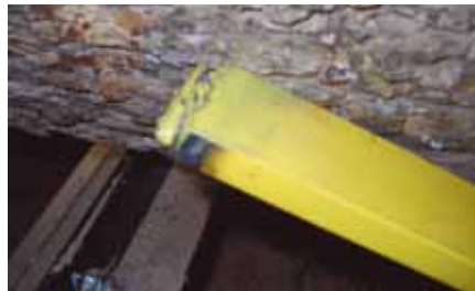
Fig. 5. With a point welded on the fixed dog, it can dig into the underside of a log surface and hold it firmly.