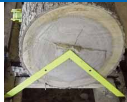
Fig. 2. The mill setup with cheaters in a 20-inch elm log.

Each log is an individual challenge, and as I open it up, I can saw to maximize unusual