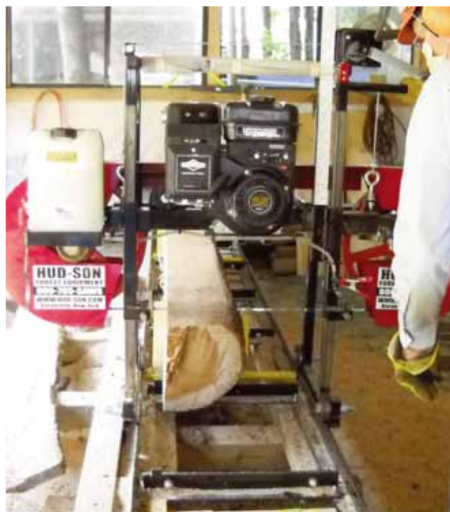
Fig. 1. Photo of operator pushing the mill through a pine log. Note all the controls and adjustments are readily accessible.

grain or sizes for projects in my wood shop or for other woodworkers. I've even tried some bias cuts to make plaques and signs. In addition to meeting my needs for lumber, it is producing unexpected income, probably enough to pay off its affordable price. My band-sawn boards require a minimum of planing, so 4/4 can actually be 7/8 of an inch—that means an extra board out of an 8-inch cant. And the sawn surface is so smooth that I can laminate 1-1/2 x 1/2 laths together for greenhouse arches without planing them.