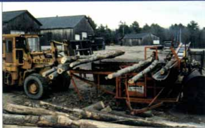
A loader preps logs for the firewood processor.

remain at his control station. The production rate was excellent, over two cords per hour during the full daily work schedule. Hawkes was reluctant to disclose the daily production.