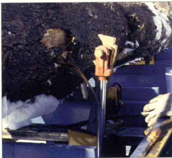
The log turner is a free-floating hydraulic unit that is used in conjunction with the log clamp (hidden in this photo).