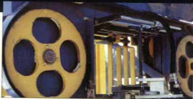
The 24-inch band wheels are machined from 1-inch solid steel and turn on 2 3 / 16 -inch bearings.

contained in a flexing plastic track that keeps everything contained and out of the way. Some chafing was evident on the terminal ends of the hoses where the saw carriage passes over them. Either a guard or relocation is indicated.