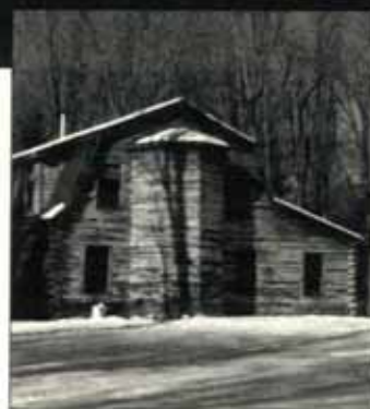
When a cabinetmaker builds a log home, expect some sophisticated joinery. The silo contains a hand-built spiral staircase.

As Phil sawed the first pine log, about 14 inches in diameter, I was impressed by the obvious power and smoothness of the Baker mill. But all was not well. A slight waviness was evident on the sawn surfaces, about 1/32 inch, which indicated that the saw was deviating from a straight line. I sug-